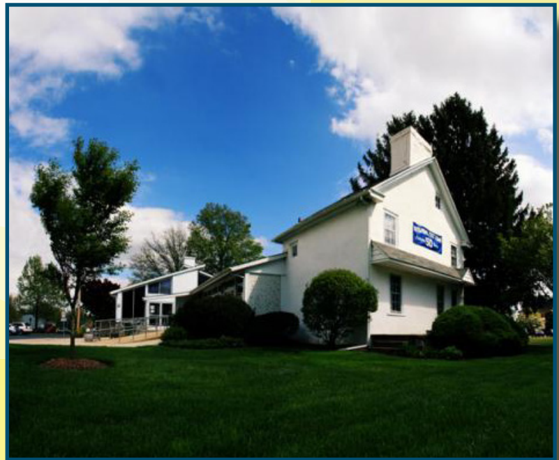
Weathers' Homestead - circa 1819, plus 1962 and 1971 Expansions