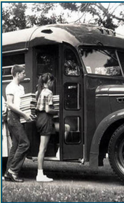
First MFL Bus - 1956

Sixty years after its start, the Middletown Free Library needs to expand again, to meet the needs of our patrons. The Friends of Middletown Free Library have been financially supporting the Library for almost 50 years. With the support of its "Friends" the Middletown Free Library functions as a resource, education, activity and, not least of all, a community center, offering many programs for patrons of all ages and strives to provide the highest level of service and resources to all its patrons.